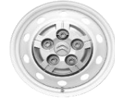
35 Heavy Panel Vans