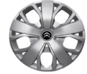
40 Panel/ Window Vans