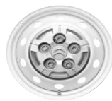
33, 35 Panel and Crew Vans