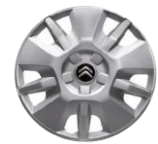
33, 35 Panel Vans